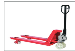
Pallet Truck Medium Duty