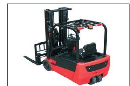
Forklift Heavy Duty (11 Ton)