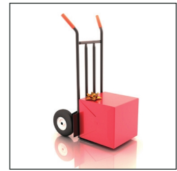
Sack Truck Light/Medium Duty