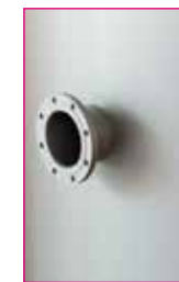
Side Outlets at 20,000 litre water level - 2nr