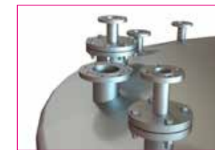
Raised Face Slip On Flanges - 16nr