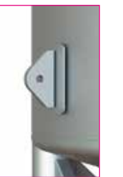
Lifting Lugs - top & side