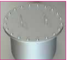
600mm Diameter Manhole Access - 1nr