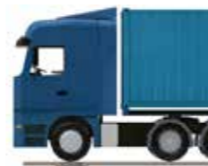
44 Ton Truck FACTA B Loading EN124 B125 Loading

Specify Kent IGUBB – Type 8 Broadcast Box Unit; 550mm x 600mm top; with a 450mm depth (Closed Use); Grade 316 Stainless Steel; 8 XLR Audio, 4 RJ45 Data, 4 Fibre, 4 Digital Video, 4 Spare