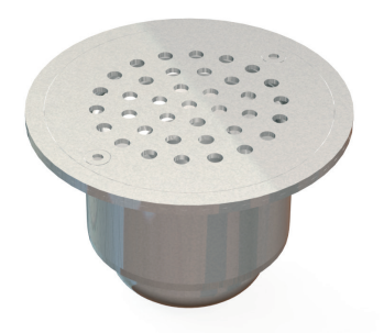
Round Top with Perforated Cover