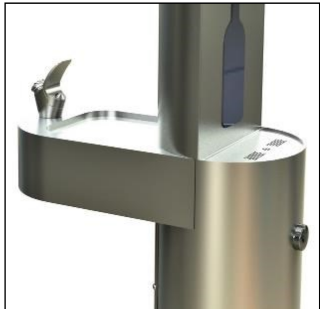
Optional Extra: Drinking fountain bubbler tap & basin